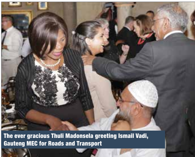
The ever gracious Thuli Madonsela greeting Ismail Vadi, Gauteng MEC for Roads and Transport